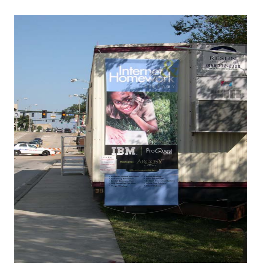
Temporary public library in Louisiana after Hurricane Rita